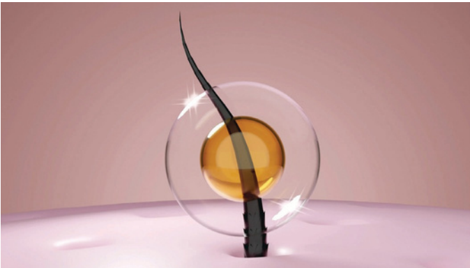
FLEXY SHINE PROTECTIVE COMPLEX