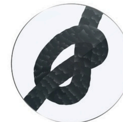
PROVA DEL NODO